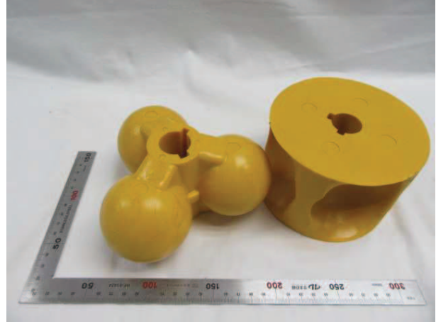
Sample No. 2