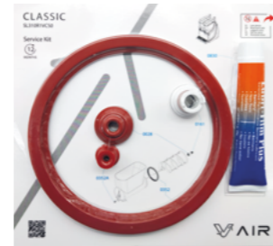
12 months maintenance kit SL310R1VCSO