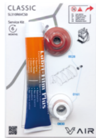
6 months maintenance kit SL310R6VCSO

Ensure the best performance of your CLASSIC and a longer lifetime easily and economically with our preventive maintenance kits.