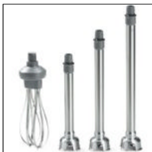
Whisk - Shaft