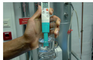
Ideally suitable for monitoring heating system water according to VDI 2035.