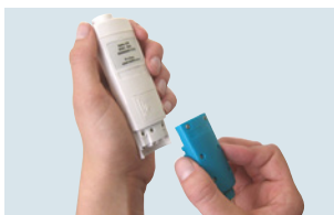
Easy exchange of probes with testo 206-pH1/-pH2/-pH3