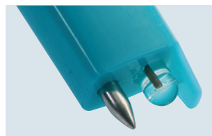
testo 206-pH1: pH1 probe head for liquids